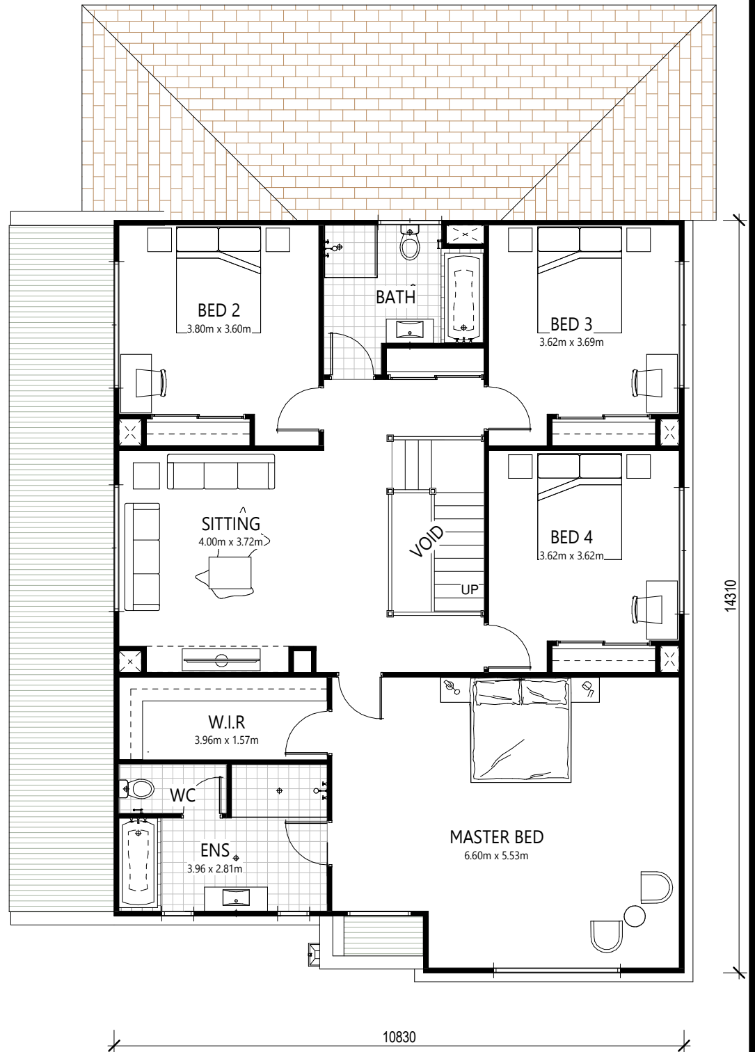
2 UPPER FLOOR LAYOUT SCALE: 1 : 100