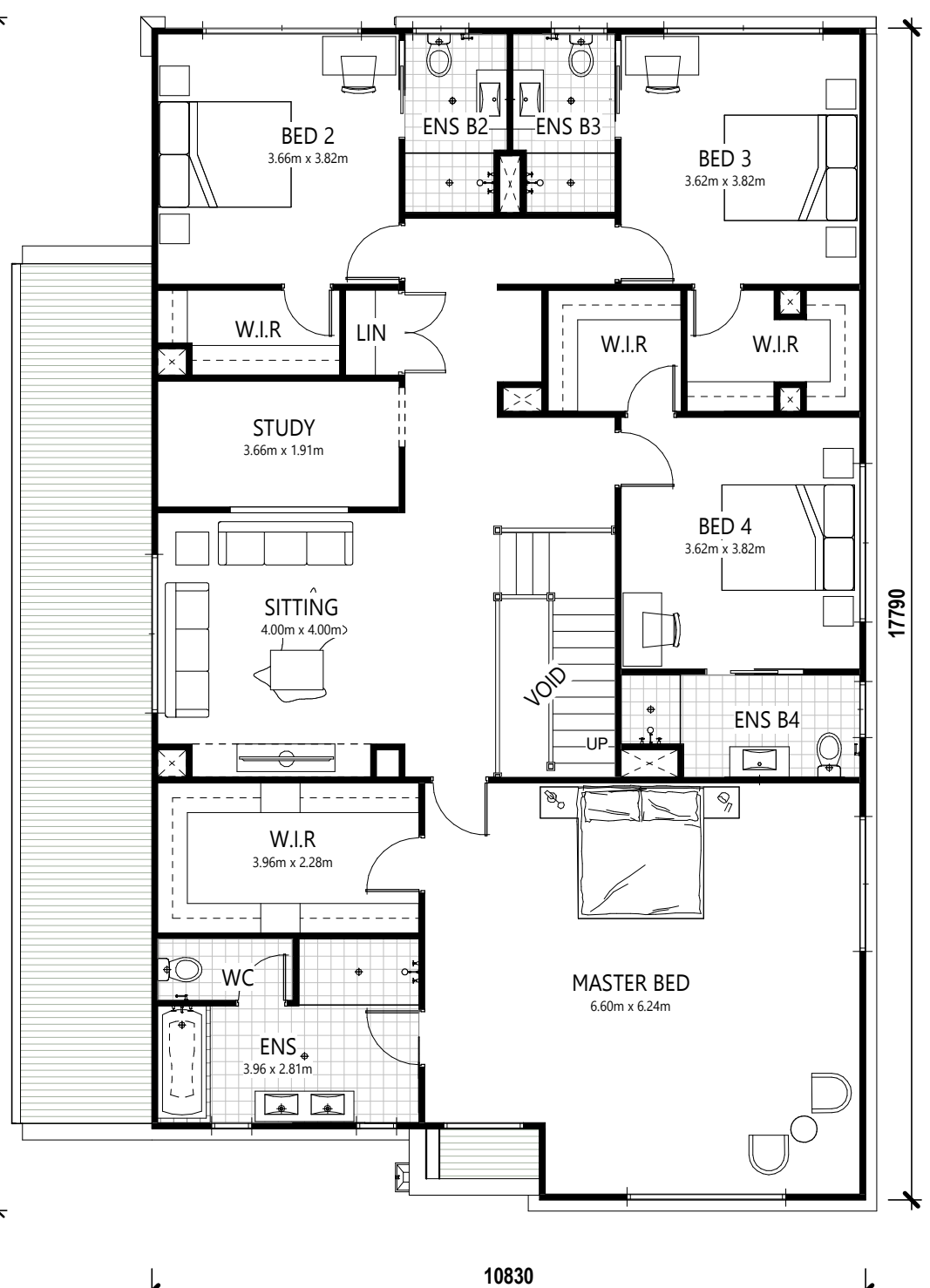
2 UPPER FLOOR LAYOUT SCALE: 1 : 100