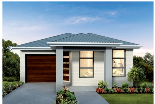
THE MESSINA FACADE