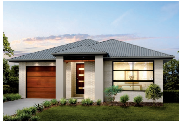
THE ORLEANS FACADE