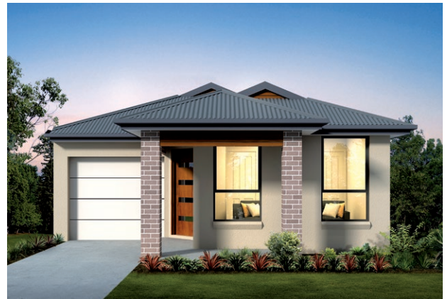
THE CENTRO FACADE