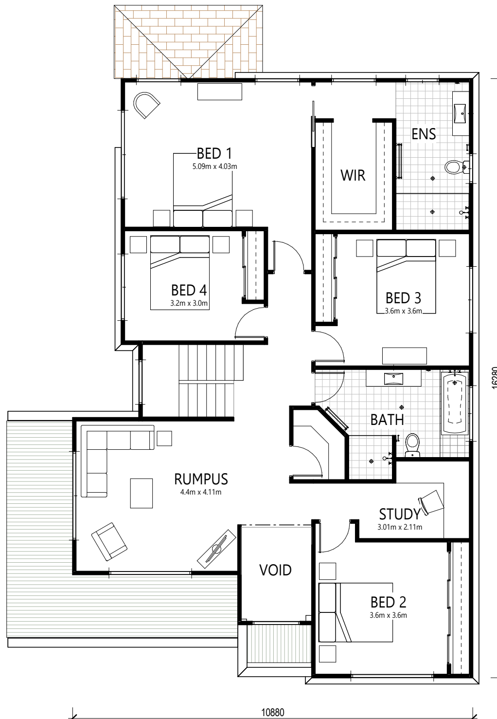
1 UPPER FLOOR LAYOUT SCALE: 1 : 100