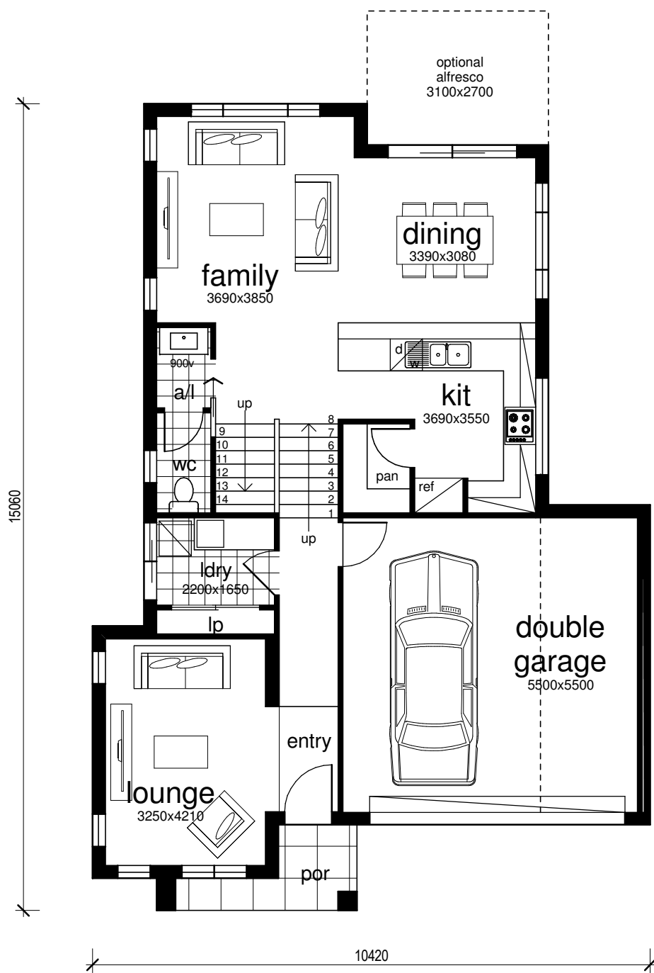
1 GROUND FLOOR SCALE: 1 : 100