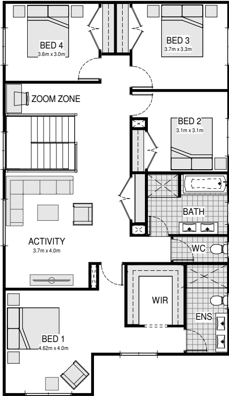
OPTIONAL FIRST FLOOR MASTER TO FRONT